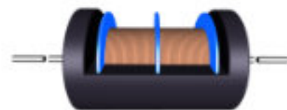
Ayrton - Perry Winding (Standard)